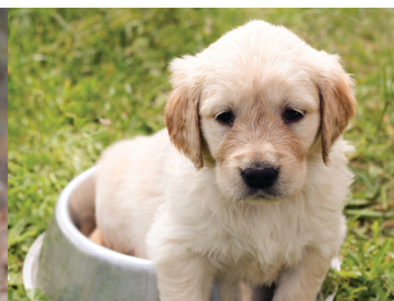
Puppy Obedience & Socialization Training