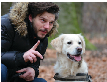
Dog Training & Behavior

Management can be the key to change this behavior.