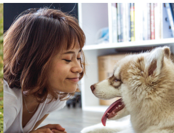
Therapy Dog Training