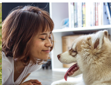
Therapy Dog Training